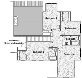
Upstairs - 3 bedrooms and 2 bathrooms